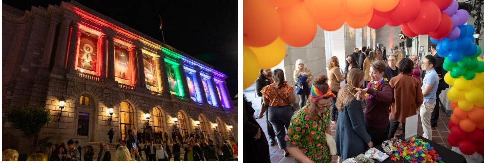
Pride Concert.

San Francisco Opera presents its second Pride Concert in the Opera House just prior to Pride Weekend. The event will showcase the San Francisco Opera Orchestra and soloists in a program celebrating LGBTQIA+ composers, performers, anthems and more. More details will be announced at a later date.