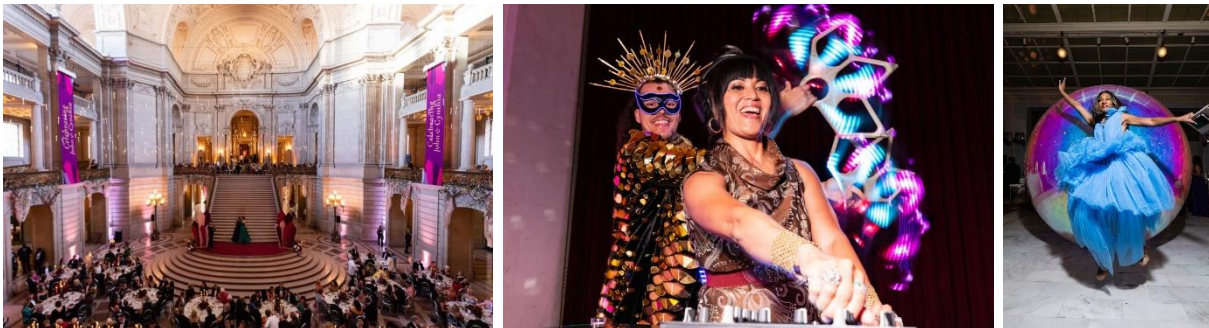
Scenes from Opera Ball.

San Francisco Opera's opening night Opera Ball , co-presented with San Francisco Opera Guild, is one of the premier events on the Bay Area's philanthropic and social calendars. The annual fundraiser begins with a cocktail reception and formal dinner at City Hall. Guests then proceed to the Opera House for the opening of the new season with Music Director Eun Sun Kim leading Verdi's Rigoletto . Dancing and late-night bites await back at City Hall after the performance.