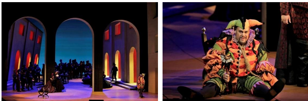
Scenes from Rigoletto.

San Francisco Opera's 103rd season opens with Rigoletto , one of the most popular and powerful operas in the repertoire. Giuseppe Verdi's 1851 tragic work follows the titular jester who mocks the Duke of Mantua's courtiers while attempting to shelter his daughter from their depraved world.