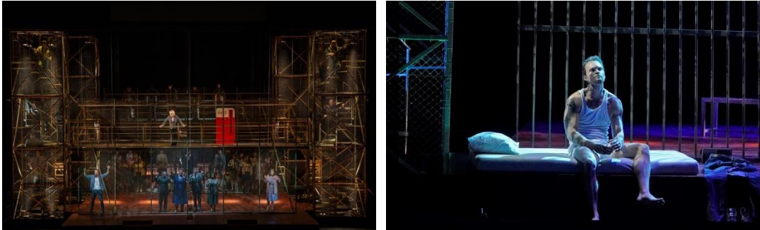
Scenes from Dead Man Walking.

Jake Heggie and Terrence McNally's Dead Man Walking , based on Sister Helen Prejean's best-selling memoir, returns to the stage where it all began. Proclaimed "a masterpiece" ( San Francisco Chronicle ) at its 2000 world premiere, the opera follows Sister Helen's spiritual journey while she ministers to a condemned man on death row. With 80 productions in 13 countries, Dead Man Walking is the most performed new opera of the last 25 years.