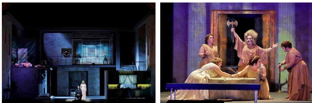
Scenes from Elektra.