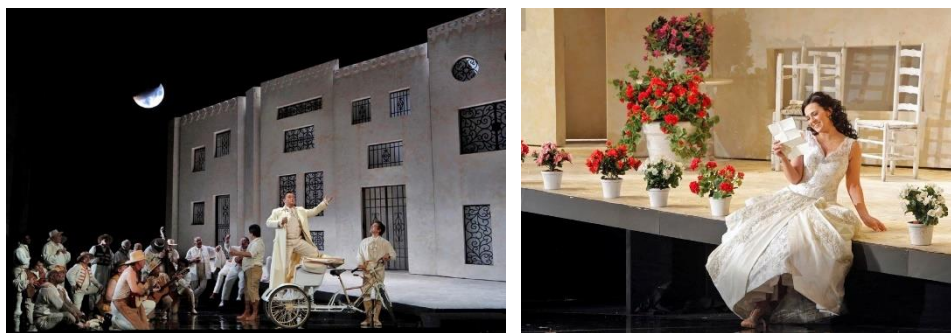
Scenes from The Barber of Seville.

THE BARBER OF SEVILLE ENCOUNTER Wednesday, June 17, 2026