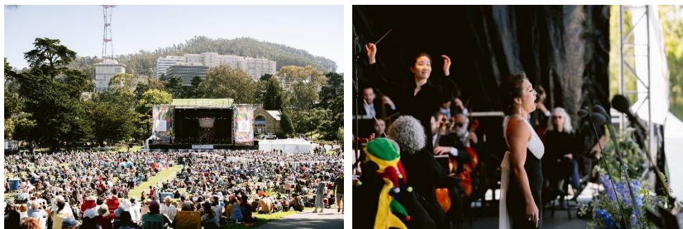
Scenes from Opera in the Park.

Opening weekend culminates with Opera in the Park , the annual free concert at Robin Williams Meadow in Golden Gate Park. This season's event marks the 50th presentation of the beloved San Francisco tradition which began in 1971 and has been a showcase for many operatic luminaries, including Marilyn Horne and Luciano Pavarotti. The concert features the San Francisco Opera Orchestra and vocal soloists from the 2025–26 Season under the baton of Eun Sun Kim. Bring your picnic baskets for this al fresco gathering attended by thousands of Bay Area residents and visitors each year.