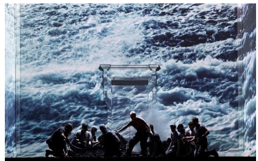
Scenes from Idomeneo.