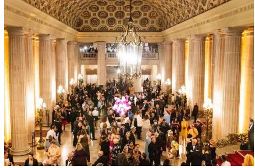
Scenes from Opera Ball in City Hall (left) and the Opera House (right).