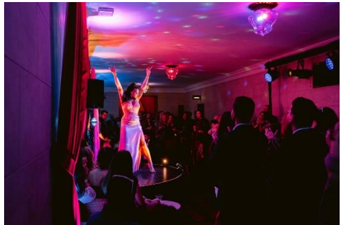
Scenes from The Elixir of Love Encounter (2023).

A special event inspired by Bizet's Carmen will transform the Opera House into an immersive evening of multi-sensory experiences. The night begins with a performance of the first act of the opera and then attendees will be transported to Seville, Spain in the lobby areas for dancing, interactive experiences and a festive party. Recommended for audiences ages 21 and over. For more information, visit sfopera.com/encounter.