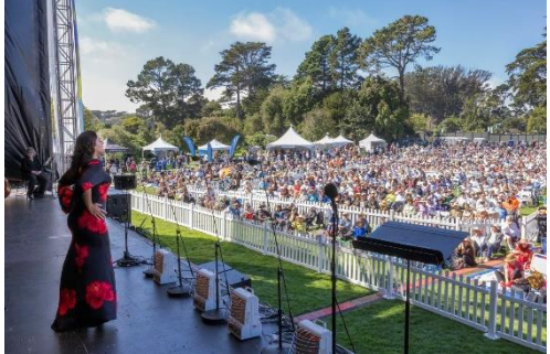
Scenes from Opera in the Park.