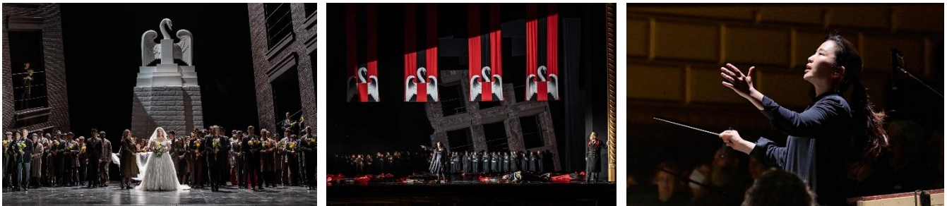
Scenes from Wagner's Lohengrin ; San Francisco Opera Music Director Eun Sun Kim