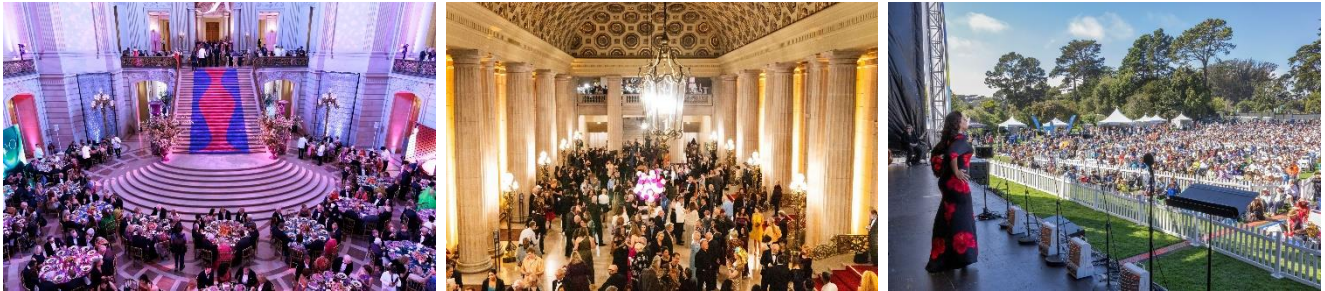
Opera Ball at City Hall (left) and the Opera House (center); the free Opera in the Park concert.