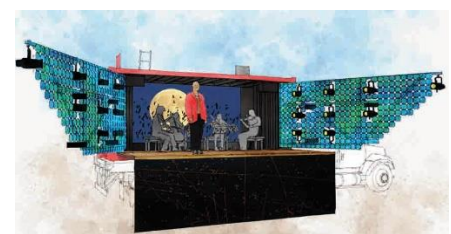
Left to right: Community Open House ; 1932 Tosca ticket; Bohème Out of the Box

San Francisco, CA (July 21, 2022) — San Francisco Opera celebrates its first 100 years with a blockbuster 2022-23 opera season and an array of opportunities for deep engagement with the Company's history. San Francisco Opera's centennial will be marked by activities designed to commemorate the past and welcome the community